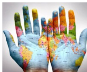
PARTNER WITH US